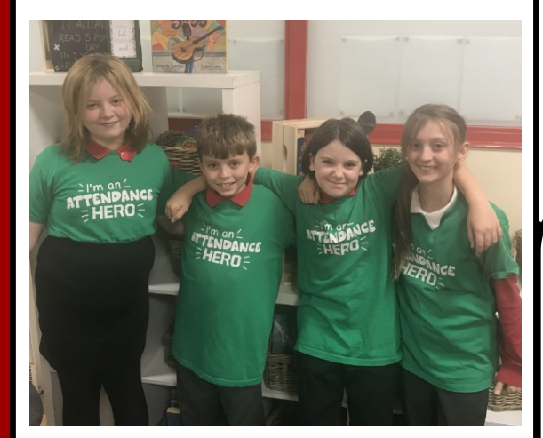
Scotsman - Green with 95.5%!