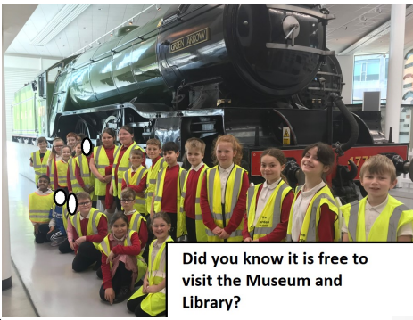
Did you know it is free to visit the Museum and Library?

Y2 staff delivered a SATs information evening - thank you to all who attended.